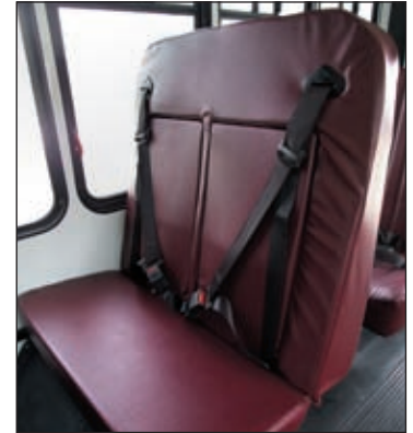
C.E. White Shoulder and lap safety seats, FMVSS compliant