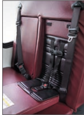
C.E. White Integrated child seat